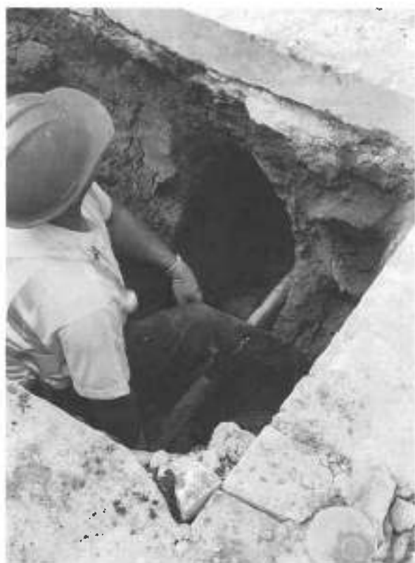
Figure 1. Photo taken at the HNE site.

Before the NIOSH evaluation, workers underwent BLL testing through their employee health services program. Two workers' blood test results indicated they had elevated BLLs (a BLL \geq 5 \mu\text{g}/\text{dL} , the reference BLL for adults in the United States) (NIOSH 2021b,c). NIOSH staff performed an exposure assessment among eight workers on two crews that worked 8-hour shifts. NIOSH collected personal air samples from workers and collected wipe samples from some workers' hands and various surfaces (truck cab components, hand-held equipment, etc.). Lead was found on workers' hands, inside work gloves, and on surfaces inside trucks and inside the locker room. None of the air sampling results were above the occupational exposure limits for lead (NIOSH REL and OSHA [AEL/PPE]). NIOSH also conducted medical interviews and observed work practices. They learned about and observed inadequate hand hygiene practices, improper use of lead removal wipes, and incorrect respirator use. These findings illustrate the significance of minimizing routes of exposures other than inhalation.