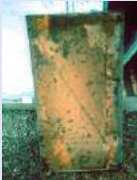
Photo 4A: Contaminated fibrous insulation inside air handler cover

Do not run the HVAC system if you know or suspect that it is contaminated with mold. If you suspect that it may be contaminated (it is part of an identified moisture problem, for instance, or there is mold growth near the intake to the system), consult EPA's guide Should You Have the Air Ducts in Your Home Cleaned? 4 before taking further action (see Resources List).