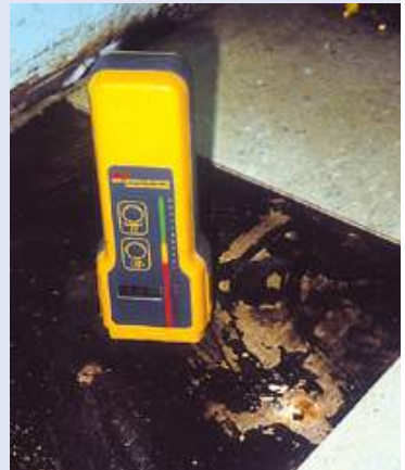
Photo 9: Moisture meter measuring moisture content of plywood subfloor