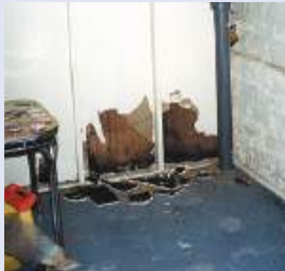
Photo 3B: Front side of wallboard looks fine, but the back side is covered with mold