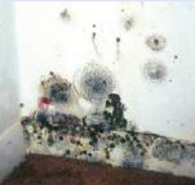
Photo 3A: Mold growing in closet as a result of condensation from room air