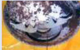
Photo 4B: Mold growth on air diffuser in ceiling