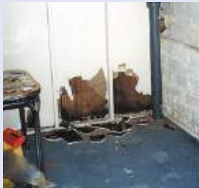
Photo 3B: Front side of wallboard looks fine, but the back side is covered with mold