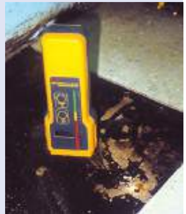
Photo 9: Moisture meter measuring moisture content of plywood subfloor