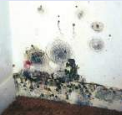
Photo 3A: Mold growing in closet as a result of condensation from room air