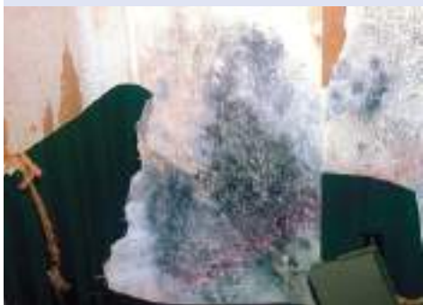
Photo 5: Mold growth behind wallpaper

problems may be difficult and will require caution when the investigation involves disturbing potential sites of mold growth—make sure to use PPE. For example, removal of wallpaper can lead to a massive release of spores from mold growing on the underside of the paper. If you believe that you may have a hidden mold problem, you may want to consider hiring an experienced professional. If you discover hidden mold, you should revise your remediation plan to account for the total area affected by mold growth.