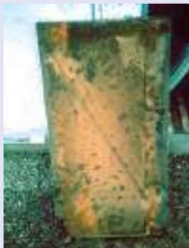
Photo 4A: Contaminated fibrous insulation inside air handler cover

Do not run the HVAC system if you know or suspect that it is contaminated with mold. If you suspect that it may be contaminated (it is part of an identified moisture problem, for instance, or there is mold growth near the intake to the system), consult EPA's guide Should You Have the Air Ducts in Your Home Cleaned? 4 before taking further action (see Resources List).